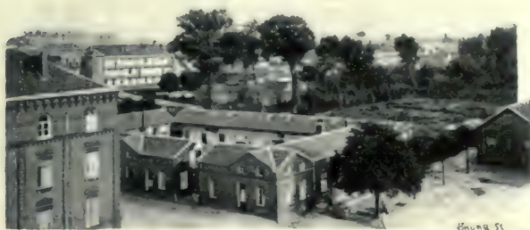
Fig. 17. ANNEXES.

paid by the society. The store sells to the general public as well as to its own members, and it therefore has to pay the tax called "patente," levied upon shopkeepers in France. All sales are strictly for cash, that is, either for coin or on production of a little book, issued by the accountant, and showing that a certain sum has been paid in advance. Only those who use these little books are entitled to share in the yearly dividend on purchases. From the grocer's shop